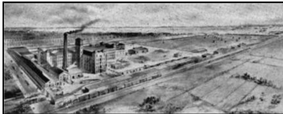
Edwin H. Fitler & Company