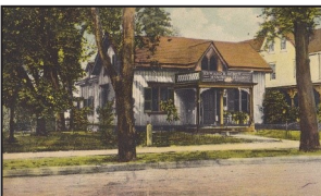
Riverton Free Library, 1909

For news and developments in between issues please go to rivertonhistory.com .