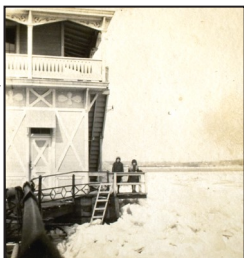
Detail of stereoview of ice jam at Riverton Yacht Club, Jan. 1920