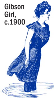
Gibson Girl, c.1900