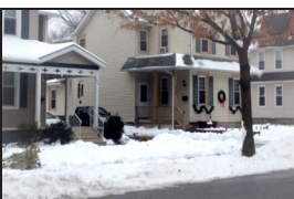
413-415 Elm St., Riverton 2014

That fortuitous exchange resulted in Mike offering to use his animated morphing technique to dramatically compare new and old pictures of other locations in Riverton. We'll report back as the project develops.