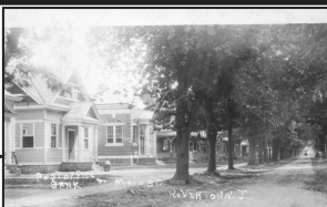
Main Street, Riverton, 1907

is one of several collectors of local history artifacts and ephemera who have provided many rare scans of images from their collections that the Society would not otherwise be able to obtain.