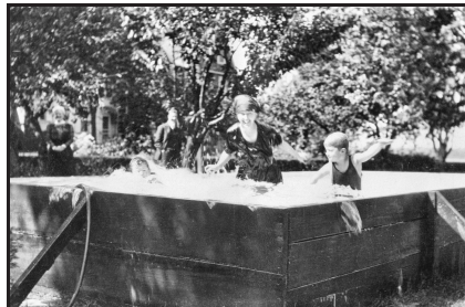
THIS EARLY 1900S PHOTO OF KIDS CAVORTING IN A HOMEMADE SWIMMING POOL at 109 Bank Avenue reached 1.2K Facebook viewers, which was 833% above our average.