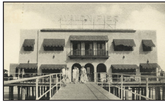
Avalon Pier, Avalon, N.J. - Postmarked AUG 5, 1930

none have elicited the engagement of visitors more than the ones of the Jersey shore. Which shore is your favorite?