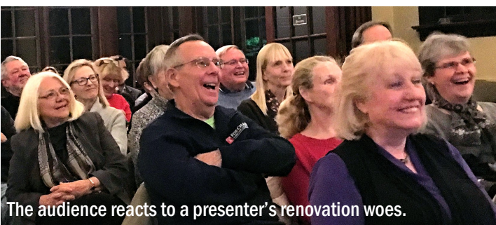
The audience reacts to a presenter's renovation woes.