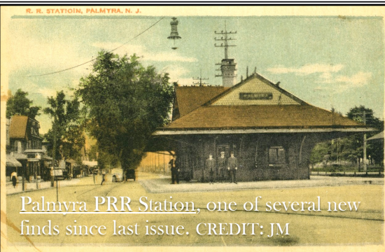
Palmyra PRR Station, one of several new finds since last issue.