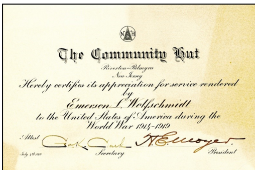
Community Hut certificate dated July 4, 1918