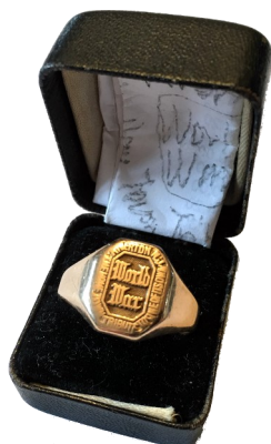
See more details about this ring on page 4.