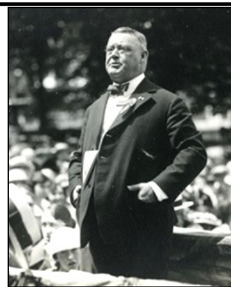
Mayor William E. Bennett July 5, 1920

In early 1919, Riverton residents considered multiple options which would be "as a suitable