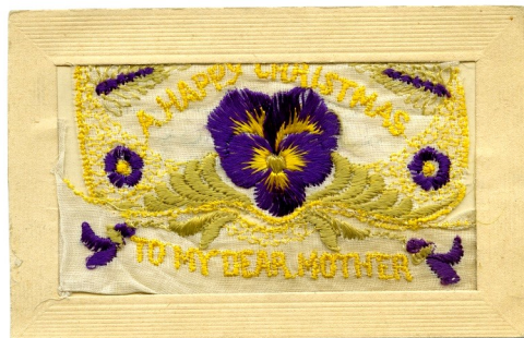
Embroidered fabric: A HAPPY CHRISTMAS TO MY DEAR MOTHER

On the "Home Front" in the March 2017 Gaslight News described the entertainments and amusements offered at the Hut.