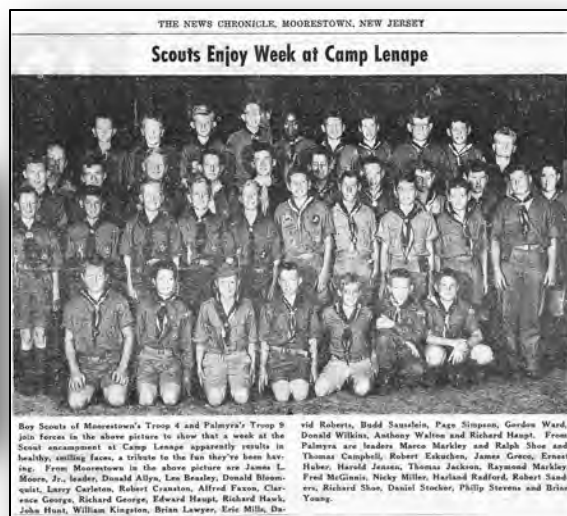
THE NEWS CHRONICLE, MOORESTOWN, NEW JERSEY Scouts Enjoy Week at Camp Lenape

comments, it was one of our most nostalgia inducing topics published.