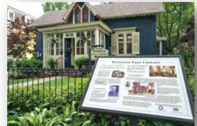
RFL marker, June 2018