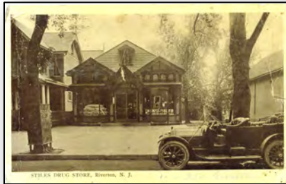
Stiles Drug Store, Riverton, NJ 1916

People check in on our Facebook page from all over. After acquiring an old postcard on eBay, I swapped out our Facebook Cover Photo in mid-August. Reaching just over a thousand people made me realize that a refresher on the history of one Main Street business might be in order.