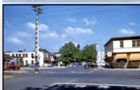
Wolffschmidt's Esso Keatings