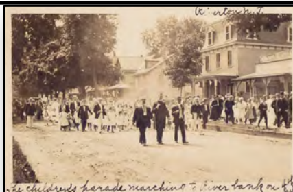
Children's Parade