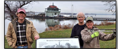
RYC marker, Dec. 2017