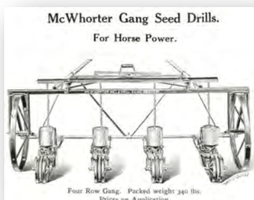
McWhorter Gang Seed Drills. For Horse Power.

When an unusual c.1907 farm implement catalog for McWhorter Mfg. Co. in Riverton, NJ with a purple cover and green text surfaced on eBay, I bid for it even though I had no clue where such a factory would have stood.