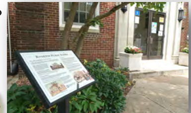
RPS marker, June 2018