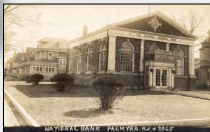
Palmyra Nat'l Bank RPPC

Riverton's Cinnaminson National Bank to issue banknotes.