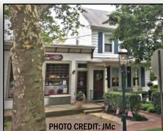
Then & Now – 518 Main Street