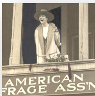
Jeannette Rankin

Board Meeting to plan Candlelight House Tour display 7 pm, Wednesday, October 24, 2018 Place to be determined