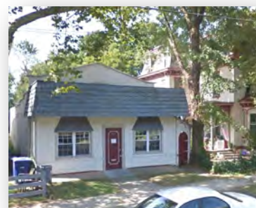
414 Main St.