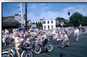
P.R.R. Station Klipple's Bakery

See bigger views of Bruce Gunn's c1950s color slides online at rivertonhistory.com