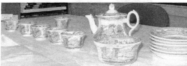
Bottom Left- Charlotte Lippincott displays a late 19th century fine china Children's Tea Set .