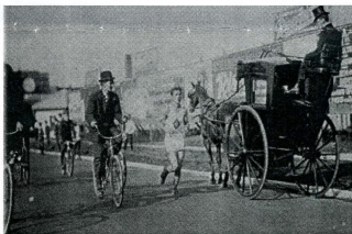
Three turn of the century leisure activities—marathon running, riding in a horse & buggy and bicycling.

“New Jersey is home to the United States Bicycling Hall of Fame. For over five decades Somerville, New Jersey has been the host to bicycling’s Kentucky Derby known as the Tour of Somerville.” U.S. Bicycling Hall of Fame