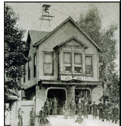
Palmyra's Independence Fire Co. No. 1 20th anniversary in 1907