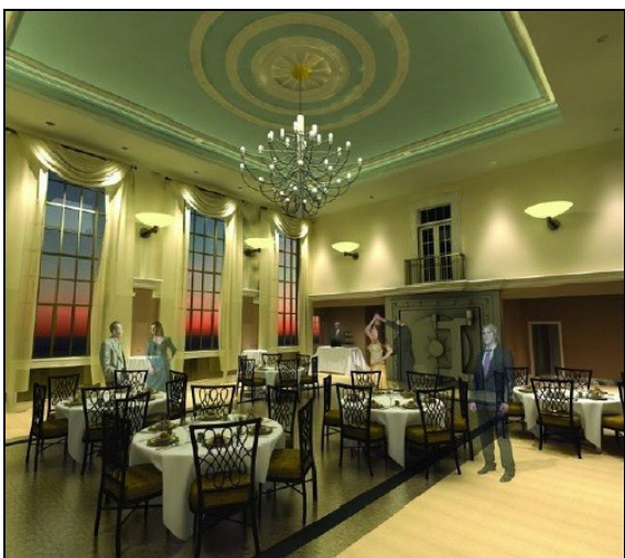
Artist's conception of The Bank on Main , the new private venue for social and business events at 604 Main Street in Riverton, NJ