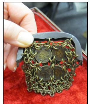
one-of-a-kind purse made of chain and Civil War era coins