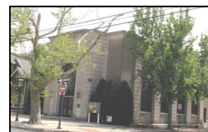
The Bank on Main 2011