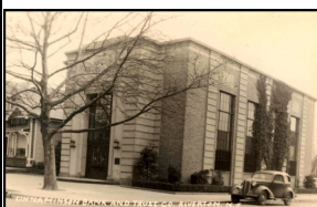
Cinnaminson Bank & Trust Co. c. mid-1930s

In Riverton's latest example of "What's old is new again," the Historical Society of Riverton will hold its Annual Meeting at The Bank on Main , the new private venue for social and business events, courtesy of the Antonucci Family of Riverton. Re-scheduled from its usual May date in order for the Society to make use of this extraordinary offer, the meeting is now planned for Thursday, June 9, 2011, at 7:30 p.m. Please R.S.V.P. to reserve a seat.