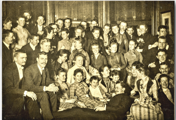
Sociable at Coales, 100 Lippincott Ave., May 4, 1889

Save the Date! On Saturday, November 23, from 6 to 10 , our family is hosting a house party to raise funds for the Historical Society of Riverton's youth programs, including history writing scholarships for Riverton School and Palmyra High School students.