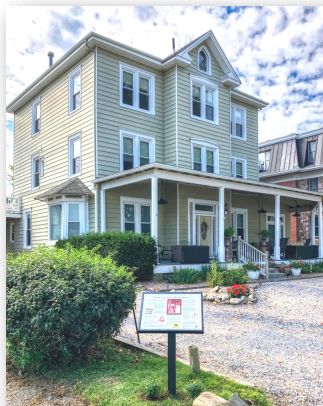
A plaque at 309 Bank Avenue explains the home's pedigree