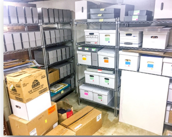
The basement of the Library serves as the vault for the archives and artifact collection of the HSR

Materials are now housed in new cubic foot storage boxes on newly acquired archival shelving in a designated space within the Free Library of Riverton.