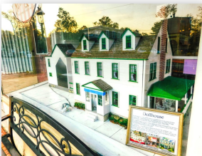
Dollhouse at Nellie Bly's

The dollhouse languished for awhile in the library basement as we thought about where it could be enjoyed.