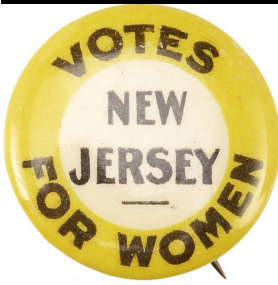
"Votes for Women" 7/8" black on yellow celluloid button, with Sommer Badge Manufacturing Co., Newark, New Jersey backmark, c1915

As the 19th Amendment turns 100, we who value history would do well to instill in another generation an appreciation for the activists and reformers whose struggle secured women's right to vote.