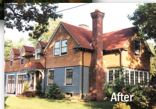
16 Carriage House Lane

Project Team that completed the Riverton Yacht Club 3-phased restoration, which includes period-designed doors, original colors through paint analysis, and restoration of the second floor Directors Room to c.1880 appearance and accessibility. The project won a 2001 NJ State Historic Preservation Project Award .