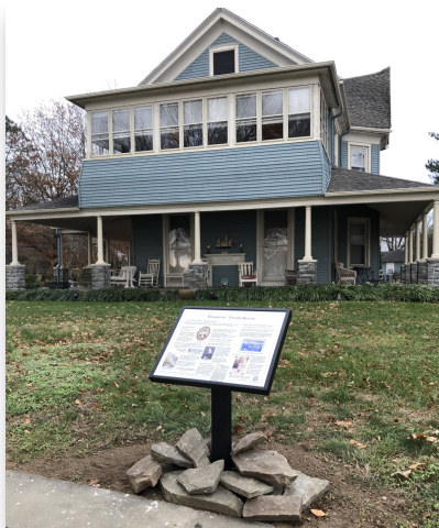
A new plaque marks 407 Bank Avenue, one of ten riverbank villas commissioned from architect Samuel Sloan by the founders of Riverton in 1851.