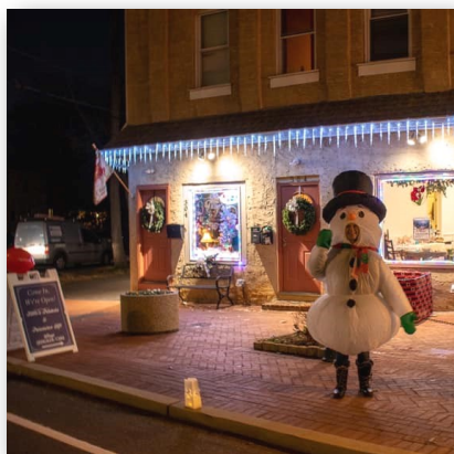
Frosty the Snowgirl.

Thank you for supporting our historic preservation effort as we mark our 52nd year in 2022.