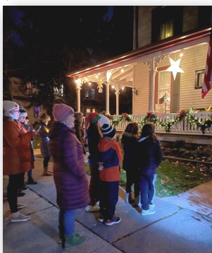
Carolers made everyone's night, including their own.