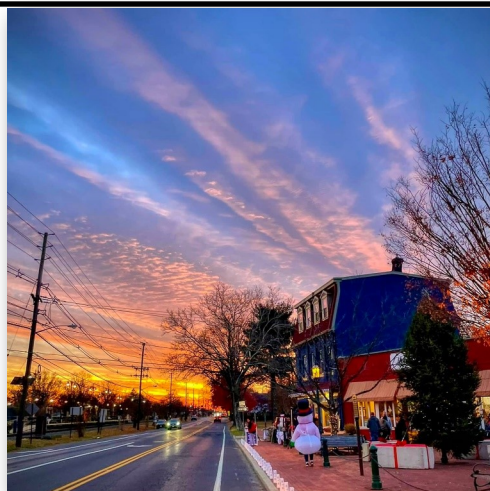
End of a perfect day