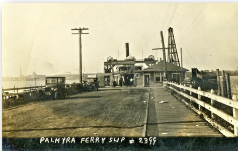
Two of the newly acquired images