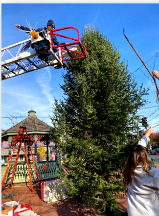
Riverton Fire Dept. sets up tree donated by The Barclay Group

Tillie's Trinkets & Treasures , Haven Hair Design Studio , Milanese Pizza , New Leaf Tea Room , Smokin' Addiction BBQ , Nellie Bly's , and the new kid on the block, The Early Bird each contributed to the holiday mood.