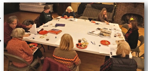
Planning at the Porch Club Dec. 9

Over the months, I met with HSR leadership to discuss and exchange ideas, pictures and stories so that everyone could weigh in on what to include.